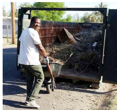
A member of a local church group participated in a cleanup organized by the Volunteer Assistance Program.

Do you have a few extra hours each month and are looking for a way to give back? The city's Neighborhood Services Department needs residents to donate time or money to its Volunteer Assistance Program.