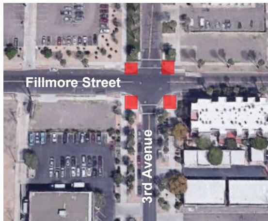
Site Location Map