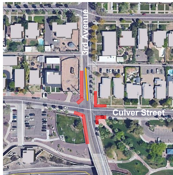
Site Location Map

Please use caution when traveling through the construction areas. We will do our best to minimize disruptions.