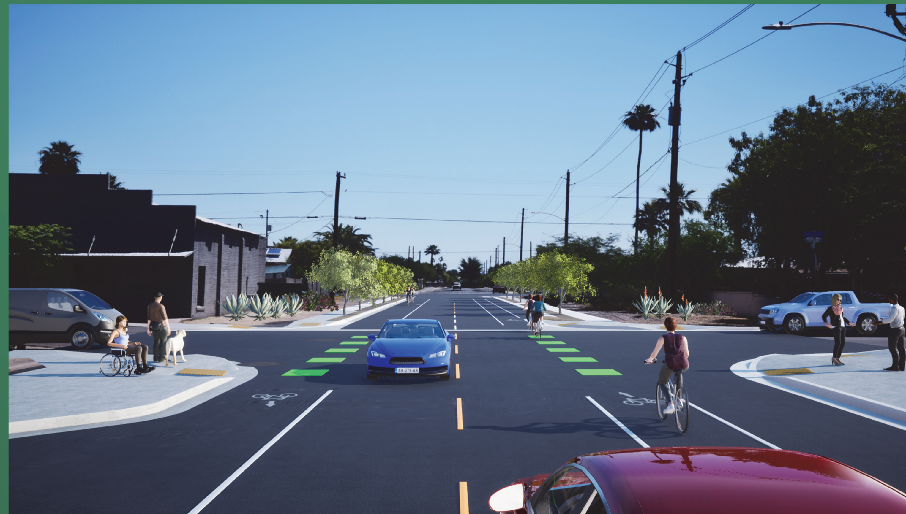
10 th Street Looking East Proposed