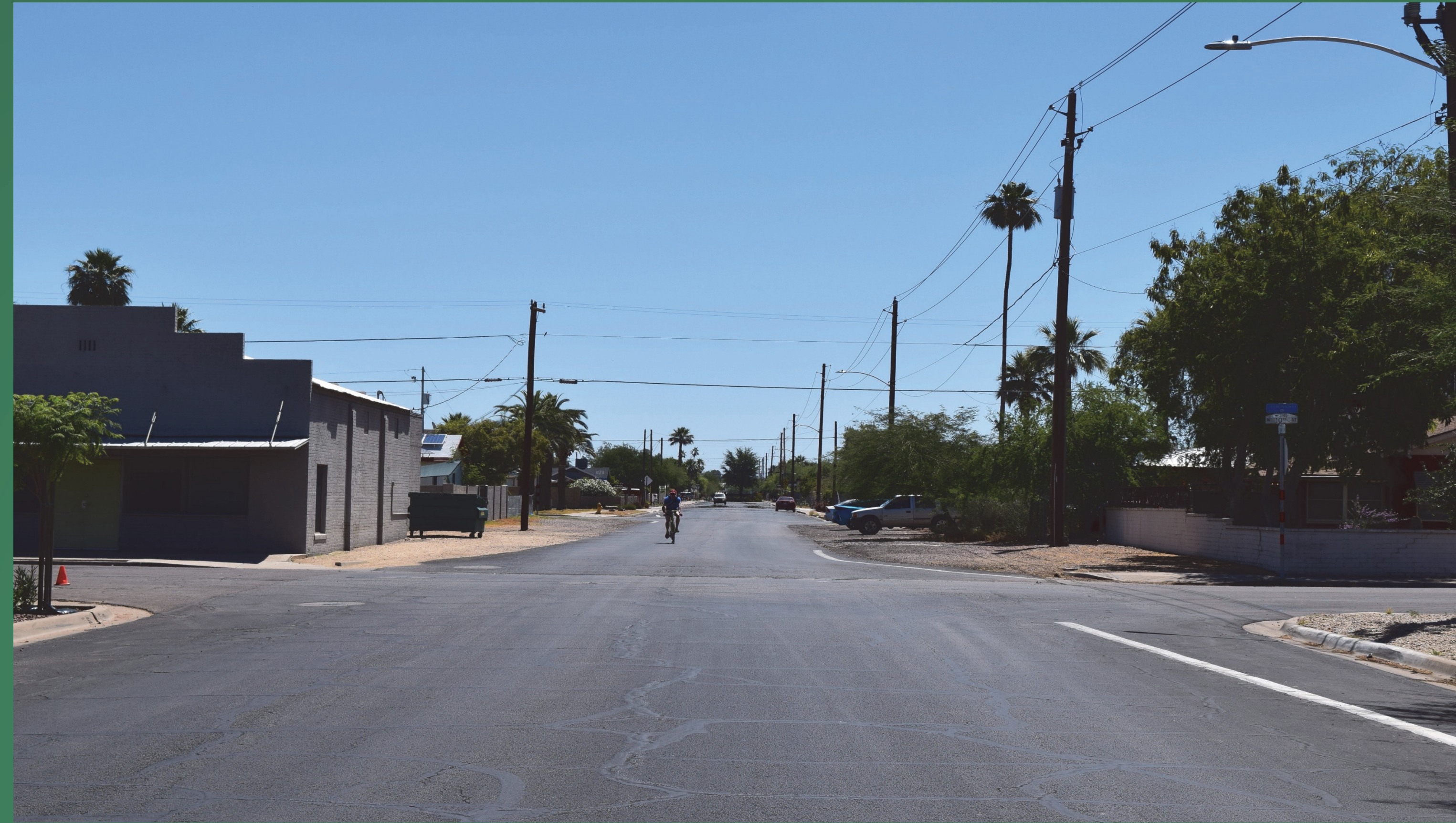
10 th Street Looking East Existing