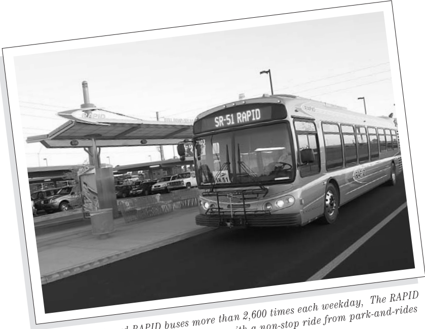
Commuters board RAPID buses more than 2,600 times each weekday. The RAPID commuter service provides passengers with a non-stop ride from park-and-rides throughout the city to the downtown and State Capitol areas.