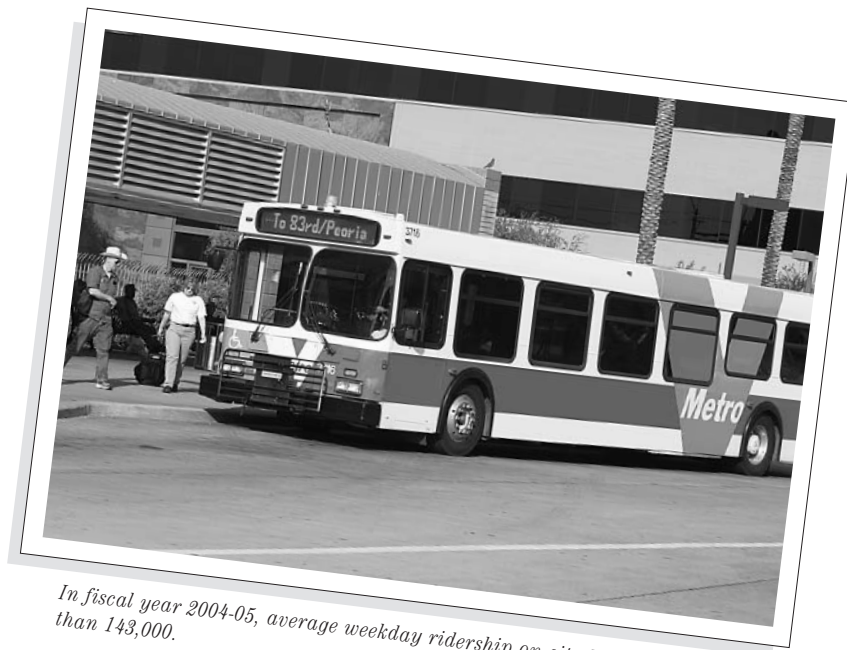
In fiscal year 2004-05, average weekday ridership on city buses was more than 143,000.