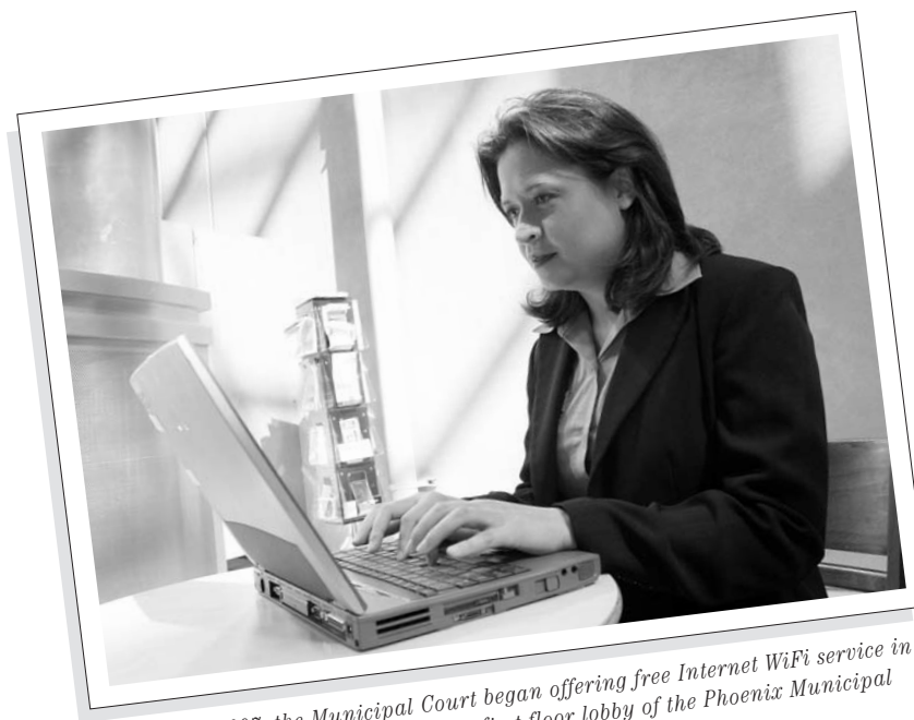
In March 2007, the Municipal Court began offering free Internet WiFi service in the Jury Assembly Room and in the first floor lobby of the Phoenix Municipal Court.