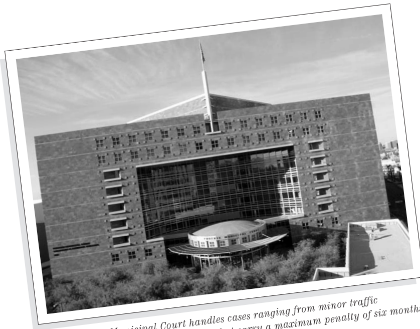
The Phoenix Municipal Court handles cases ranging from minor traffic violations to Class 1 misdemeanors that carry a maximum penalty of six months in jail and/or a $2,500 fine.