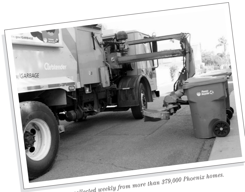
Recyclables are collected weekly from more than 379,000 Phoenix homes.