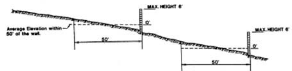
Measuring Fence Height (Figure 3)

The height of a fence or freestanding wall shall be measured from the higher of the adjacent finished grade elevations, which elevation shall be the average measured perpendicular within fifty feet of the fence (see figure 3).