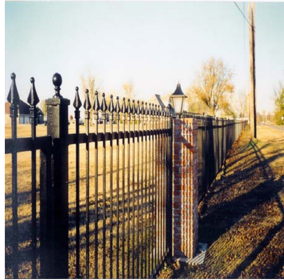
Wrought-iron fencing (Figure 4)

Per Zoning Ordinance Section 507 Tab A: Chain link fencing with plastic or metal slats, sheeting, non-decorative corrugated metal and fencing made or topped with razor, concertina, or barbed wire shall not be used where visible from public streets or adjacent residential areas. Alternatives exist, such as spiked or decorative wrought iron (see figure 4), high walls, and barrier type landscaping that can provide site security without contributing an adverse image to adjoining property.