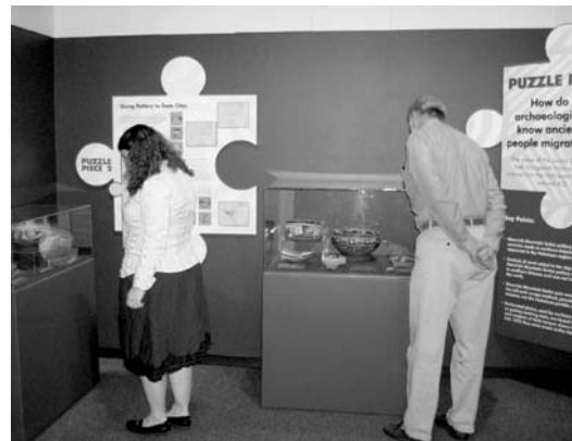
Visitors enjoy Pueblo Grande Museum's newest exhibit - Pieces of the Puzzle .

Through grants from the National Science Foundation, this research is presented for the first time at Pueblo Grande Museum. The exhibit debuted here, and will travel to other venues around the state afterwards. This dynamic exhibit explores methods for dating and analyzing existing archaeological materials; showcases how Geographical