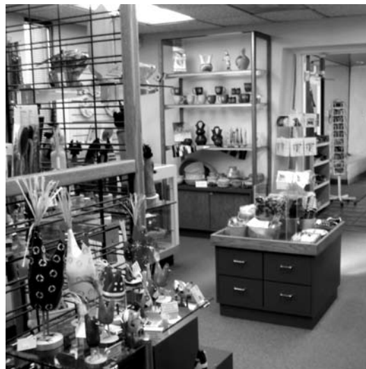
Surround yourself with beautiful things - volunteer in the Museum Store.