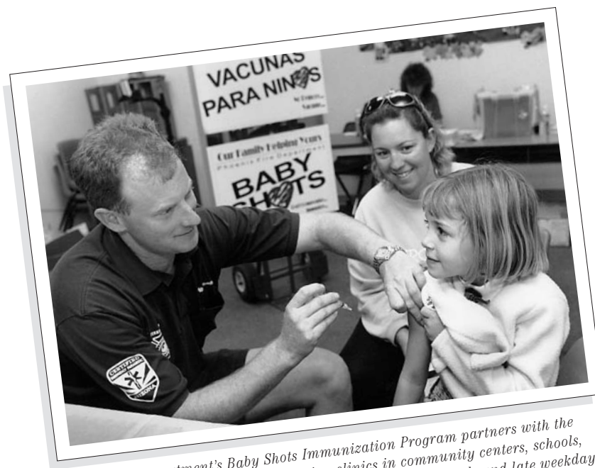
The Fire Department's Baby Shots Immunization Program partners with the community to offer free immunization clinics in community centers, schools, hospitals and shopping malls. Clinic hours are on weekends and late weekday afternoons to accommodate working parents.