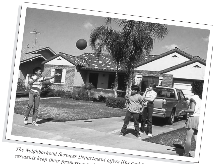
The Neighborhood Services Department offers tips and resources to help residents keep their properties and neighborhoods well-maintained.