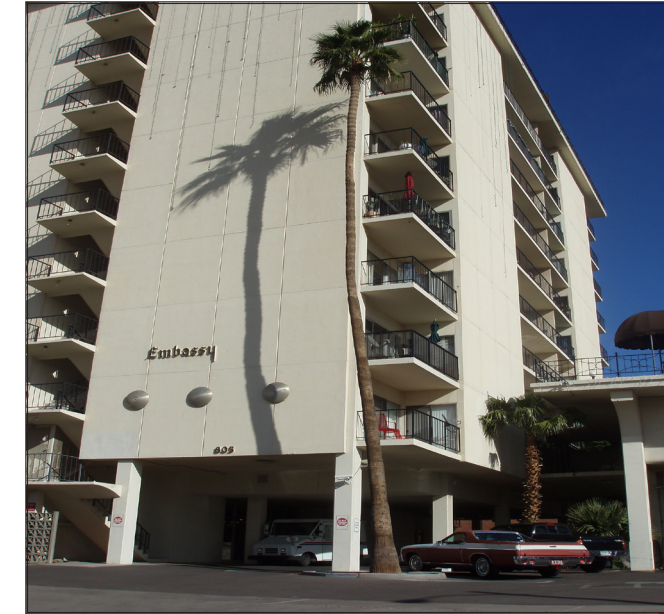
High Rise at 4th Avenue & McKinley