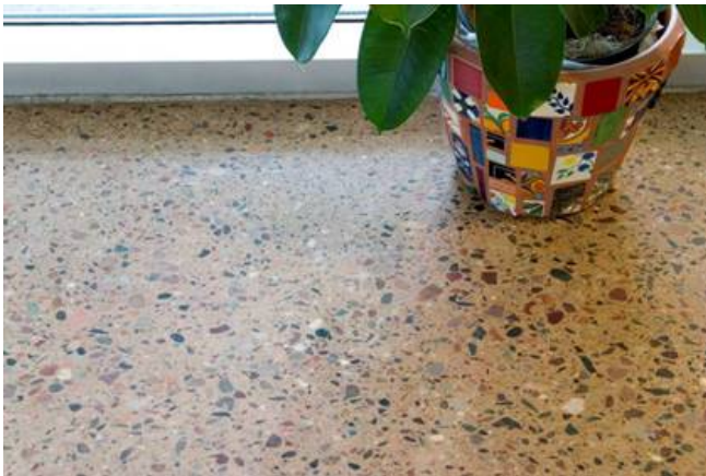
Concrete Floors (Desert Broom Library)