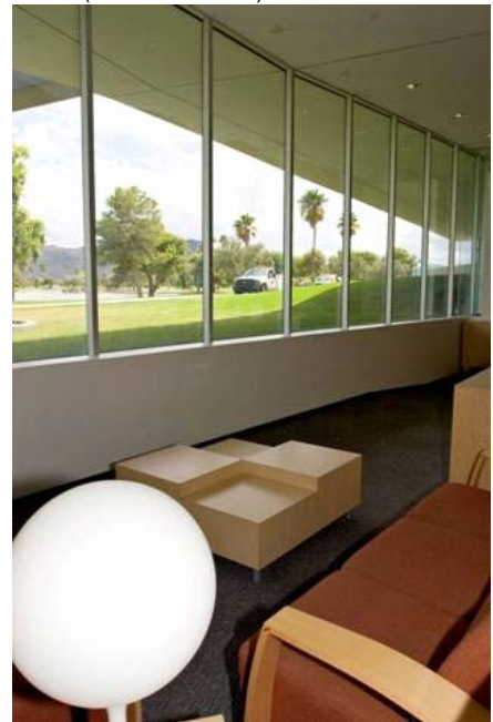
Use of daylight & views (Cesar Chavez Library)