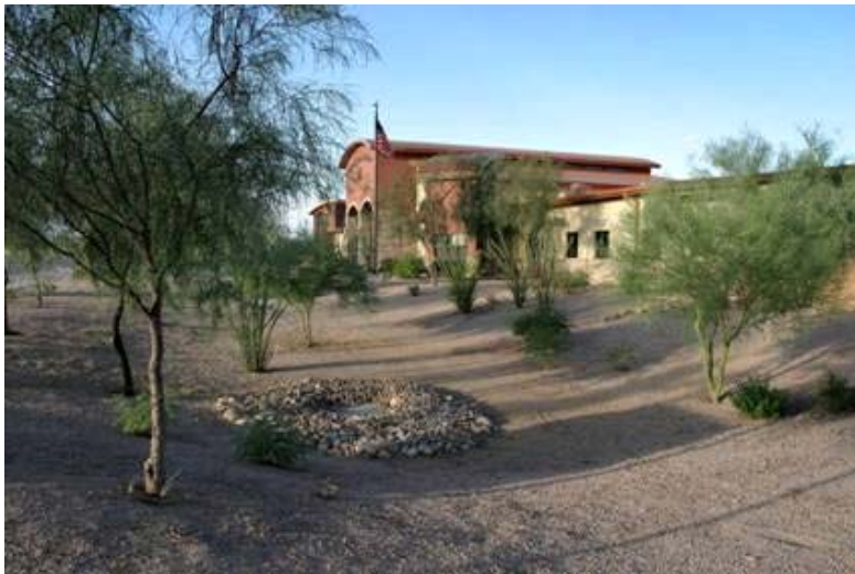
Stormwater Management (Fire Station #50)