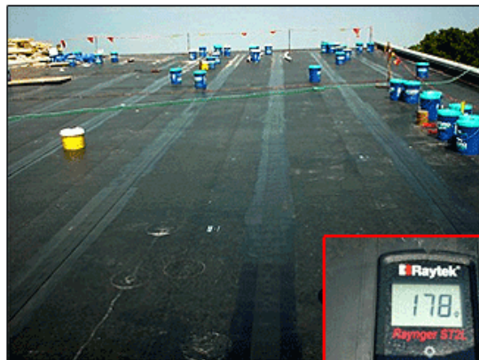
Roof Before Treatment