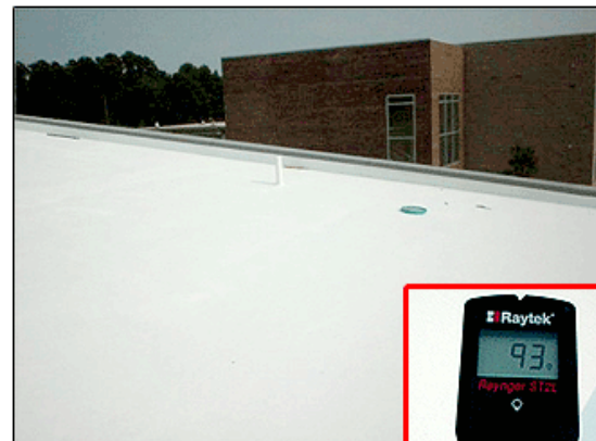
After a Cool Roof was Installed