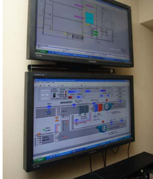
Energy Management System (Phoenix Convention Center)