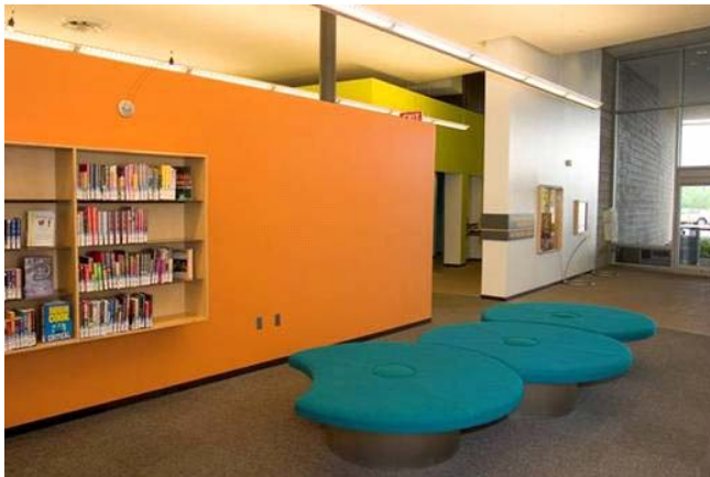
(Cesar Chavez Library)