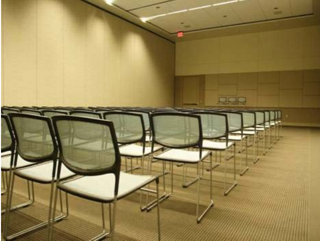
Chairs made of recycled automotive seatbelts and battery cases (Phoenix Convention Center)