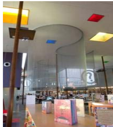
Skylights (Desert Broom Library)