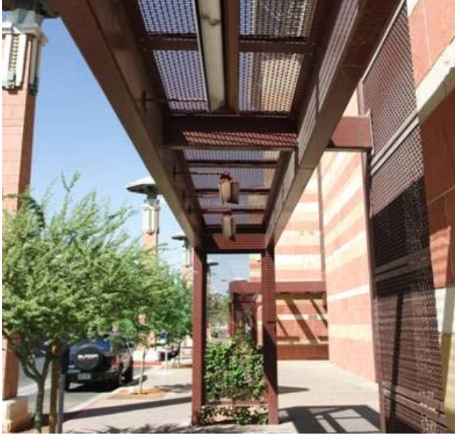
Reflectors used to prevent light pollution (Phoenix Convention Center)