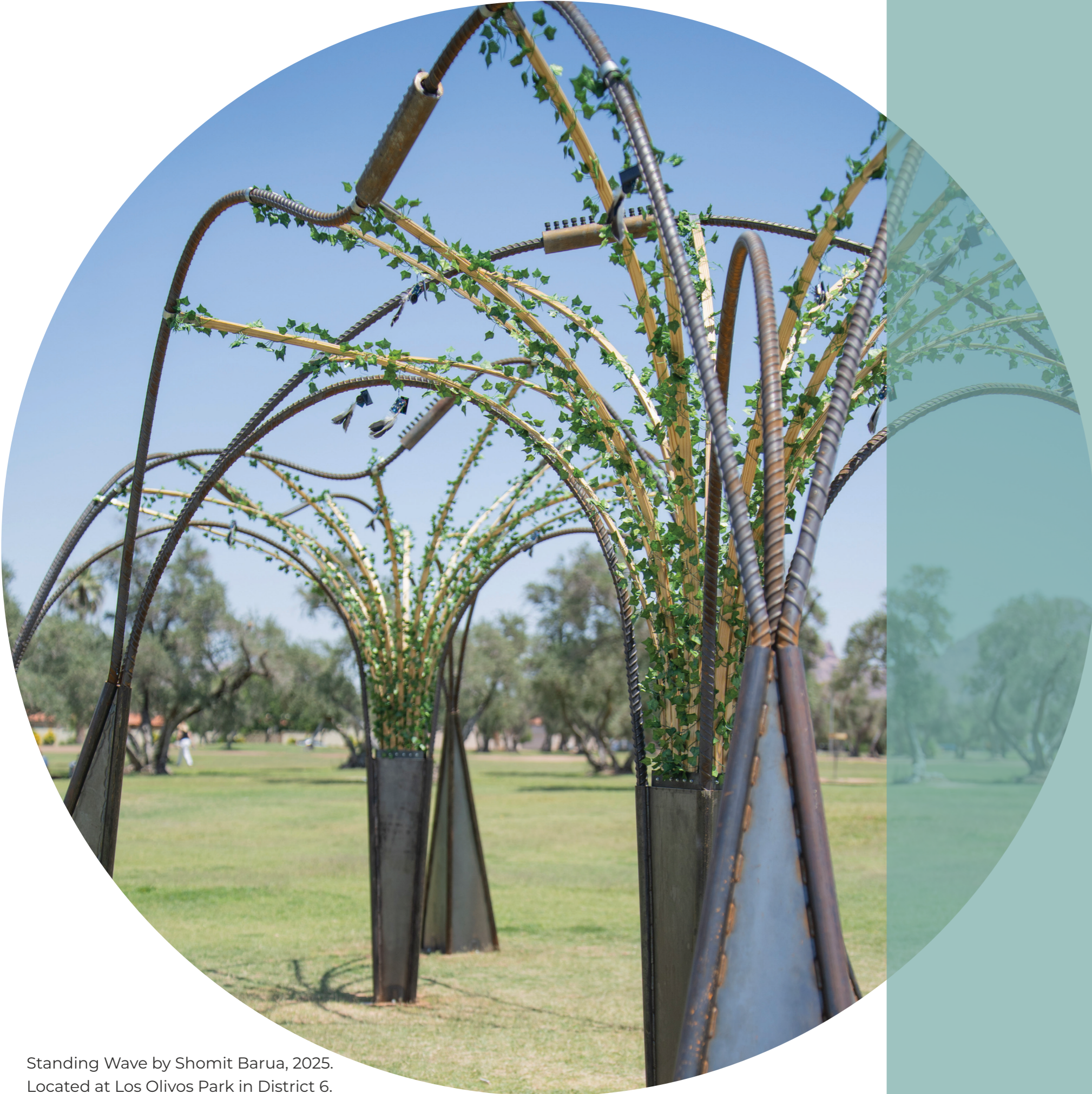
Standing Wave by Shomit Barua, 2025. Located at Los Olivos Park in District 6. ¡Sombra! Experiments in Shade temporary installation.