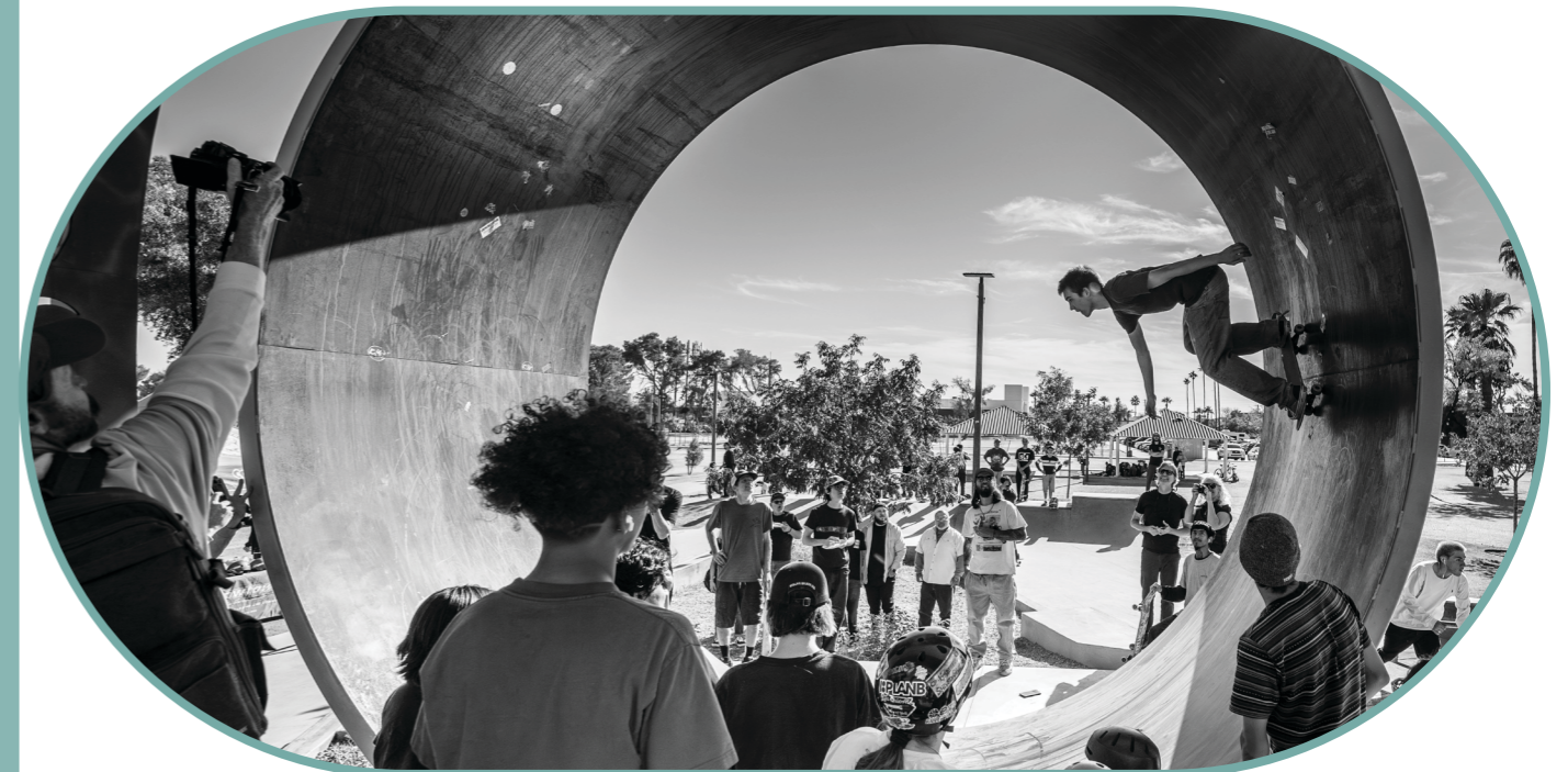
Pipe Dreams by Haddad Drugan, 2024. Located at Solano Park in District 4.

The Phoenix Office of Arts and Culture develops the Public Art Plan annually with input and assistance from the Mayor and City Council, residents, artists, city departments that provide public art project funding, and the Arts and Culture Commission. The timing of the plan coincides with the annual Capital Improvement Program, budgeted per fiscal year (for example, FY 2025-2026 = July 1, 2025 – June 30, 2026). The plan outlines several project types, including design team projects, permanent commissions, purchases of existing artwork, temporary commissions, art refurbishment and retrofits, and master planning.