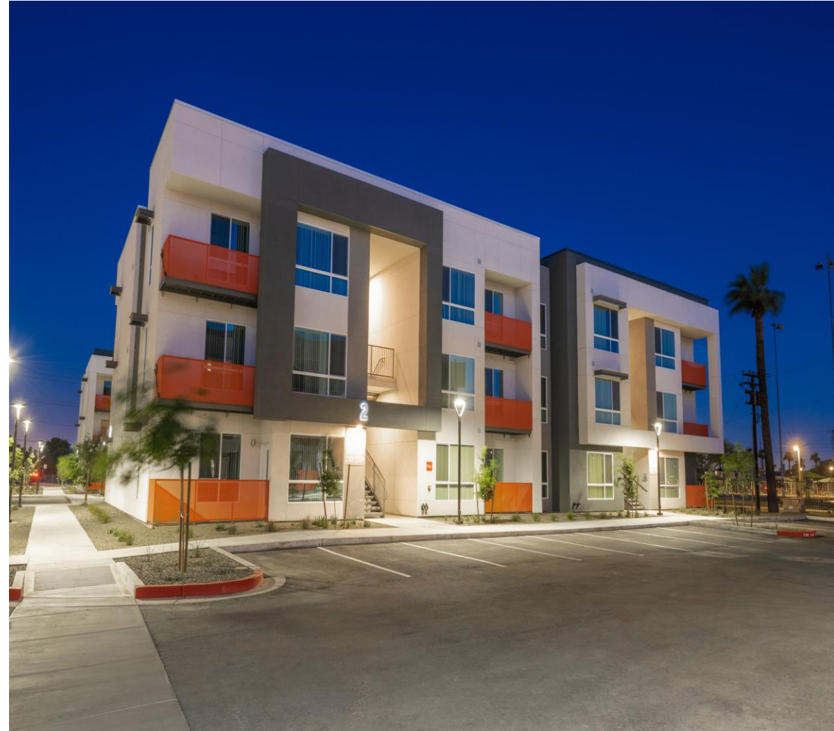
Falcon Park - Palindrome