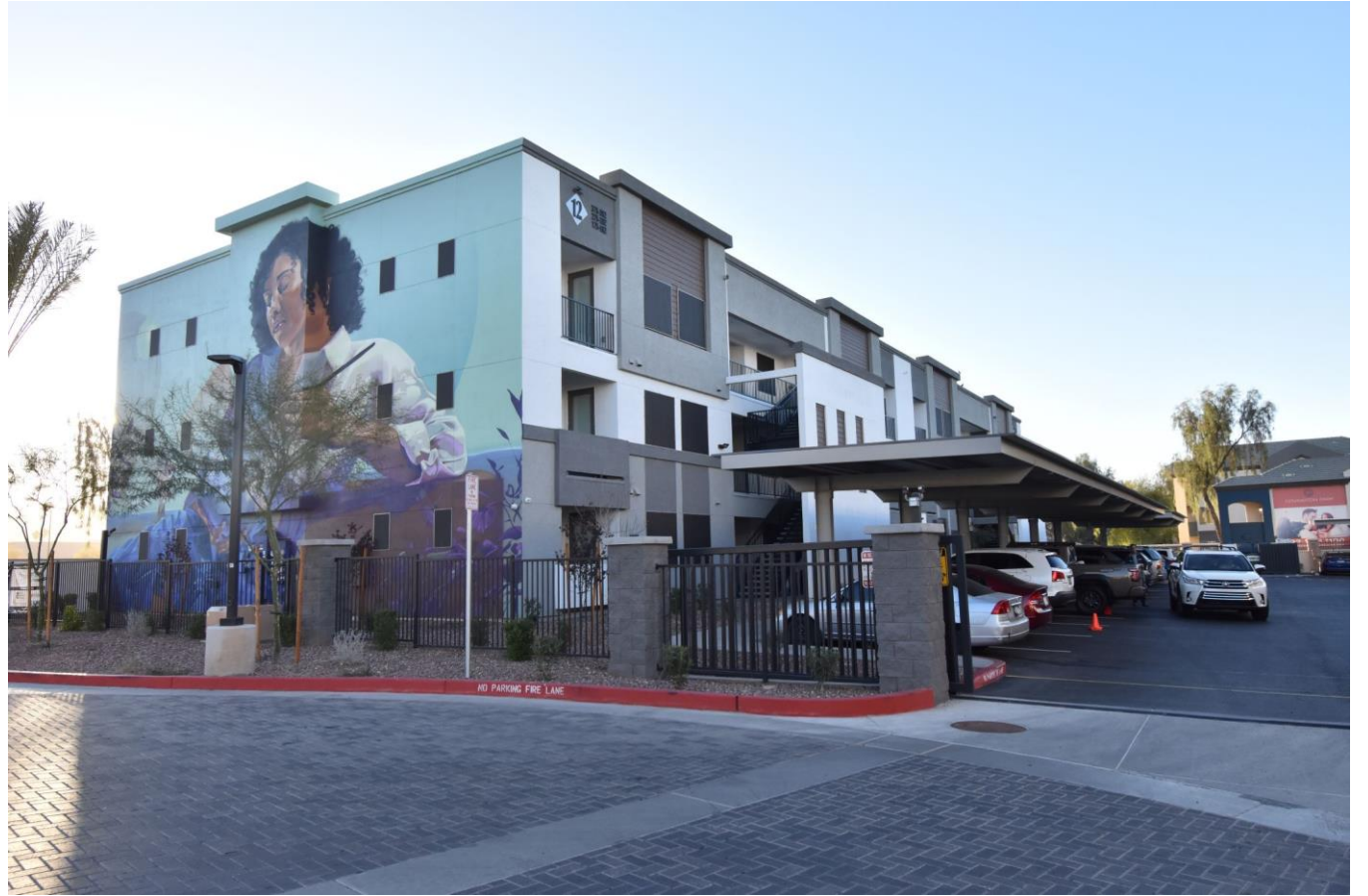
The Reserve at Thunderbird – Atlantic Development.