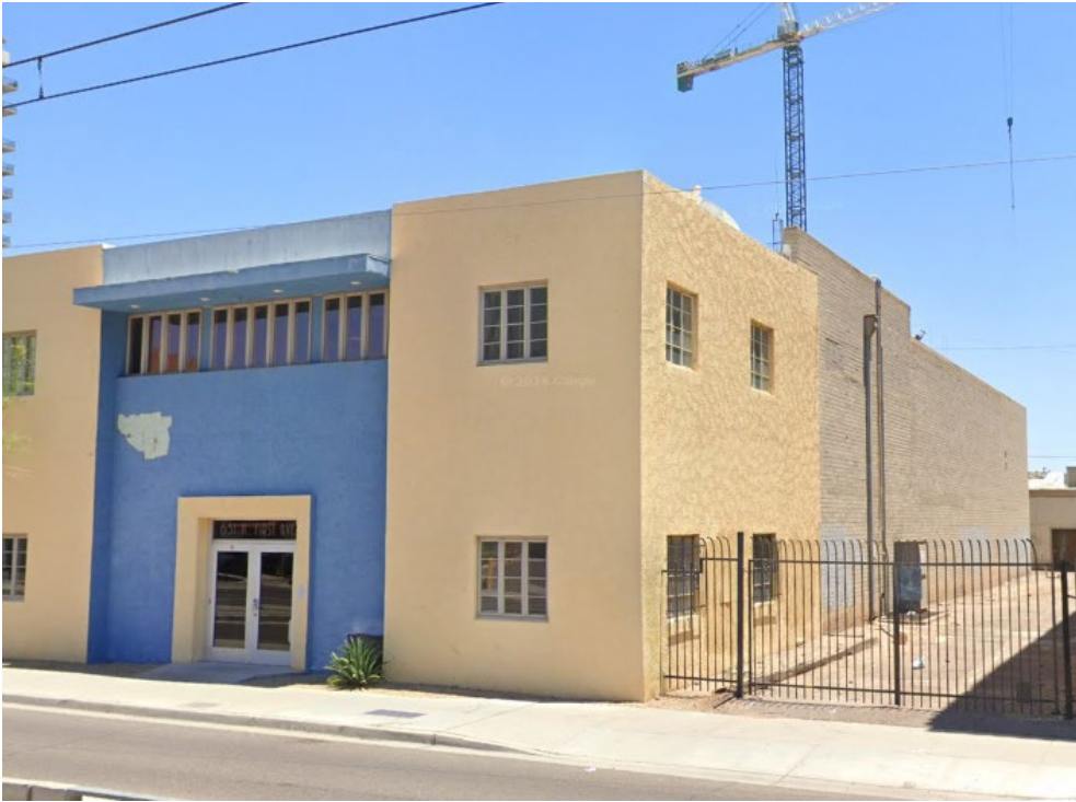
Photo 3. Western (front) and southern facades, looking northeast, Google Streetview June 2024