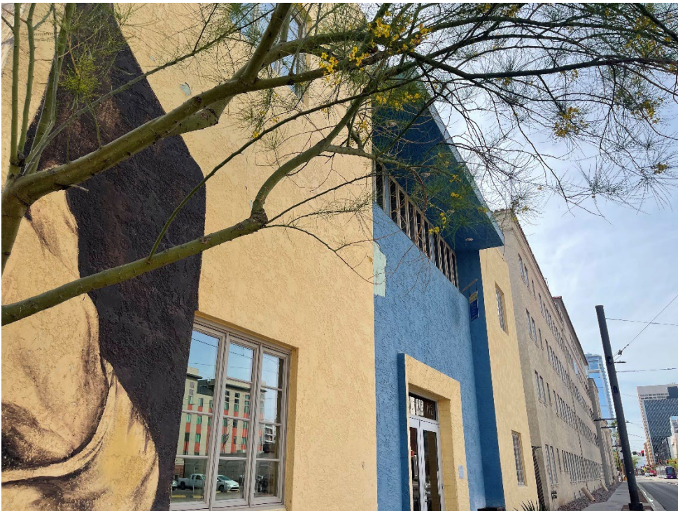
Photo 4. Front façade, looking southeast, April 2025