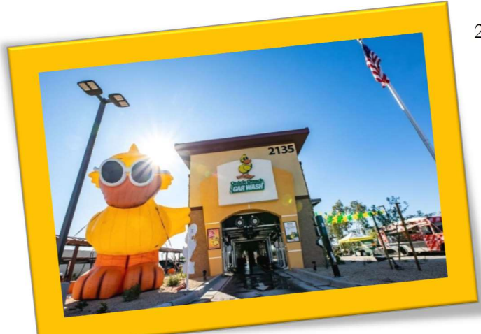
At 2135 W. Deer Valley Drive, grand opening.