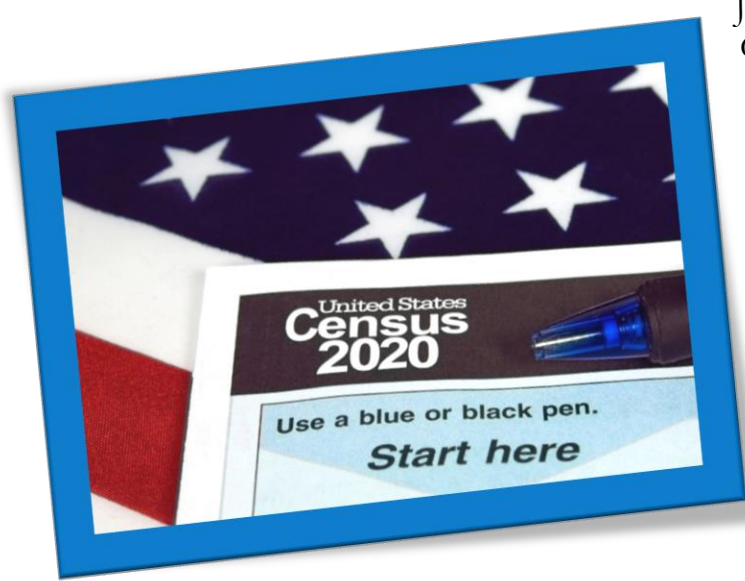
National self-response rate: 65.2% Arizona self-response rate: 61.7% Phoenix self-response rate: 63.1%