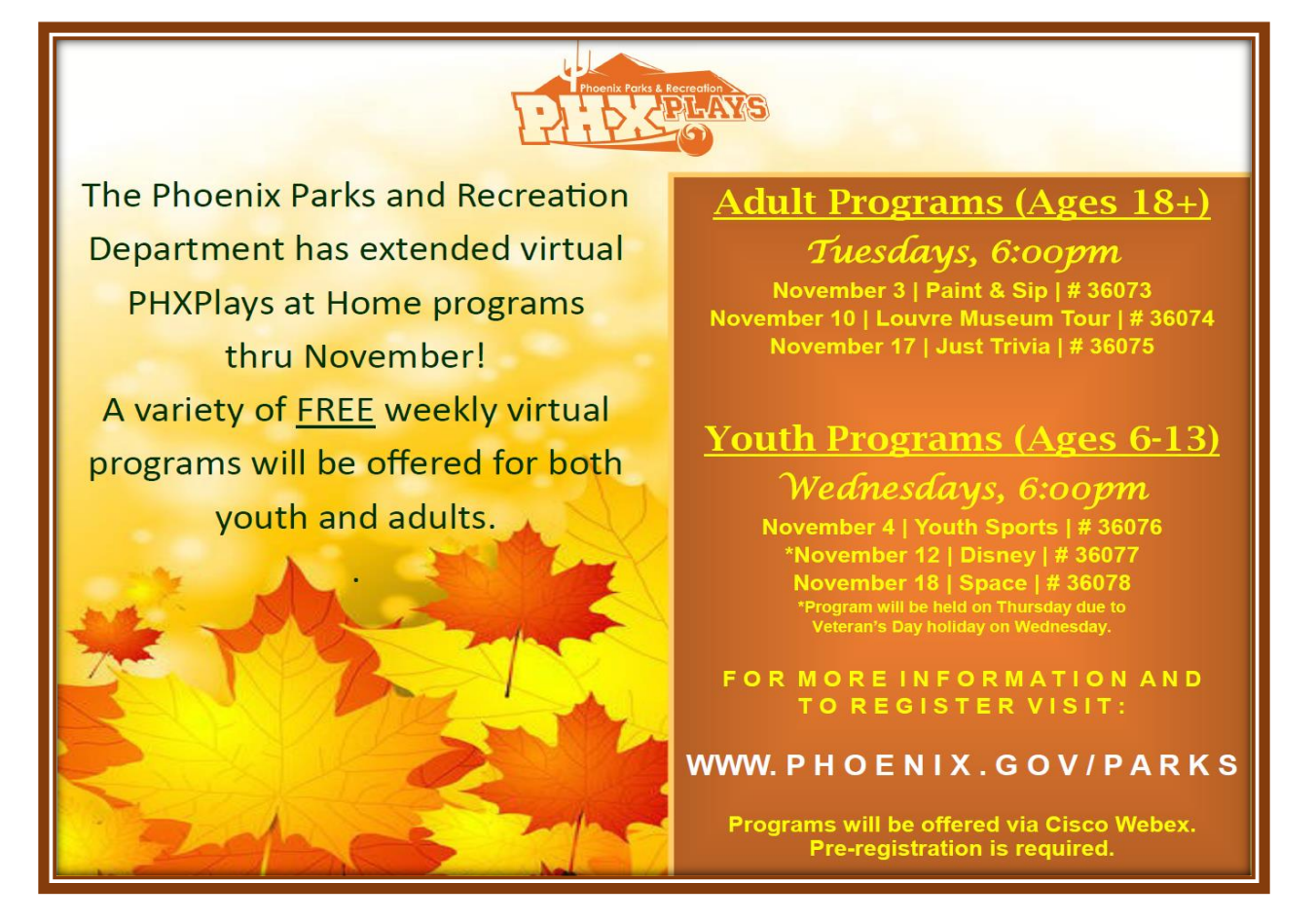
For more information and to register visit PHX PLAYS.