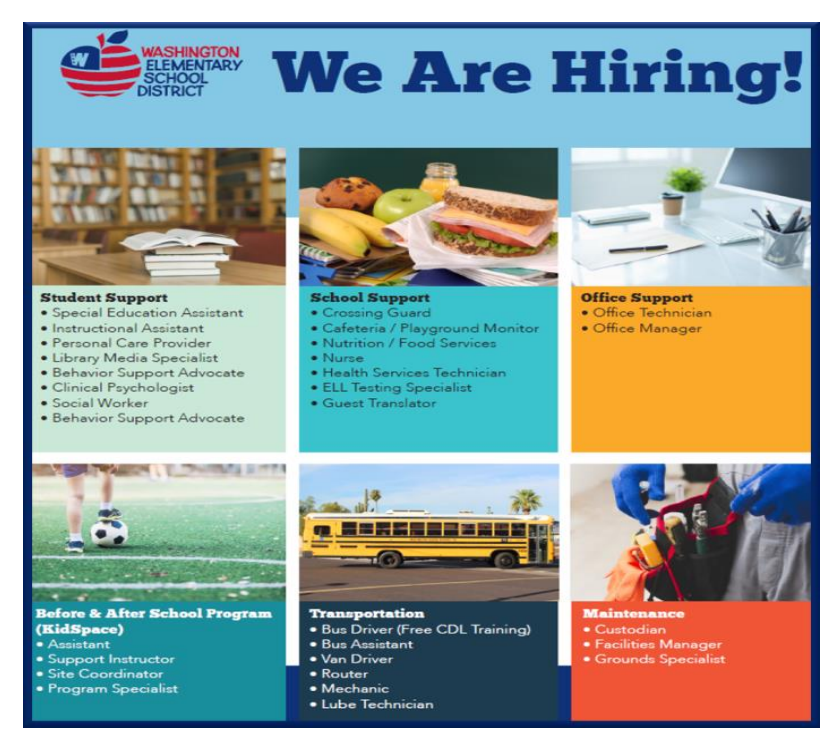
Apply today at jobs.wesdschools.org