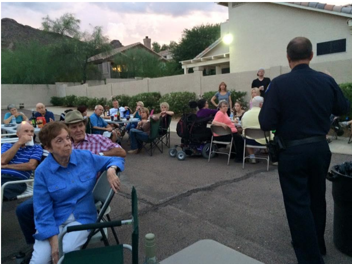
Paradise Hills / Lookout Mountain