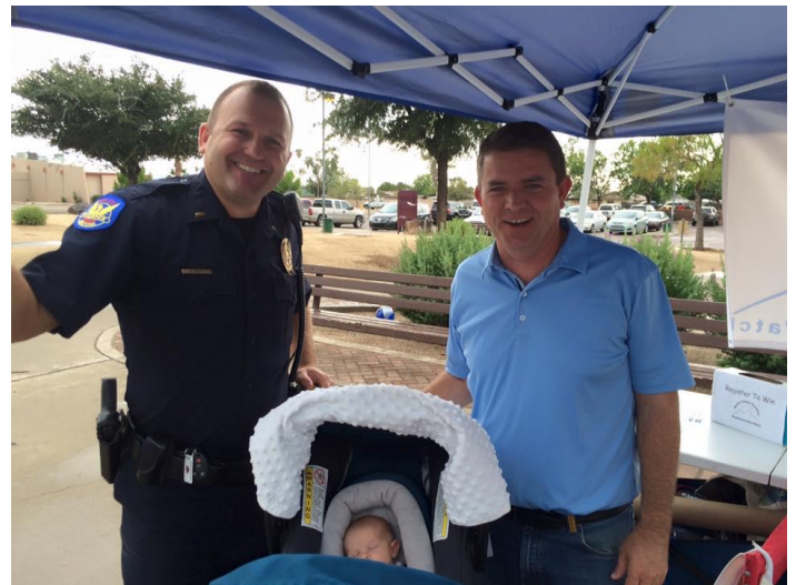
Cox Meadows and Moon Valley Gardens