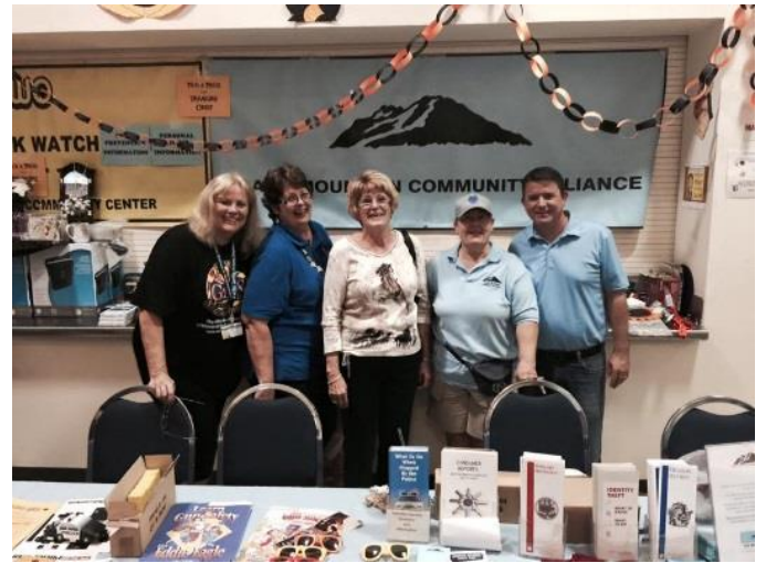
BMCA Fall-O-Ween event