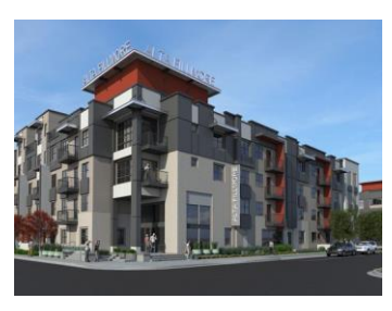
Alta Filmore - Downtown