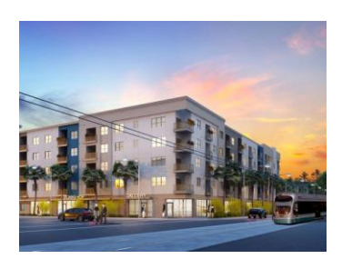
Capital Place Apts – Eastlake Park