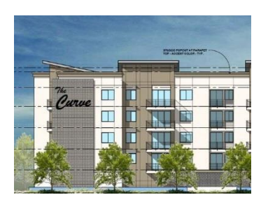
The Curve at Melrose – Melrose District