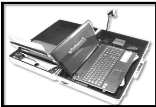
THE EZ CHILD I.D. KIT COMPUTER SYSTEM