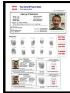
(Sample Info Sheet shows Fingerprints and I.D. Cards)