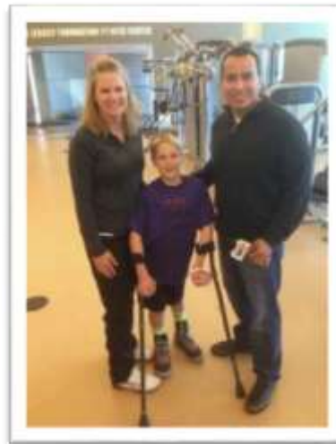
The Councilman attended SpoFit, a FitPHX talent identification event, where he met paralympic gold medalist Evan!