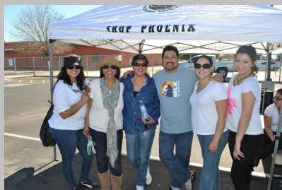
Martin Luther King, Jr. Day of Service January 18, 2014 G. Frank Davidson School 6935 W. Osborn Rd.