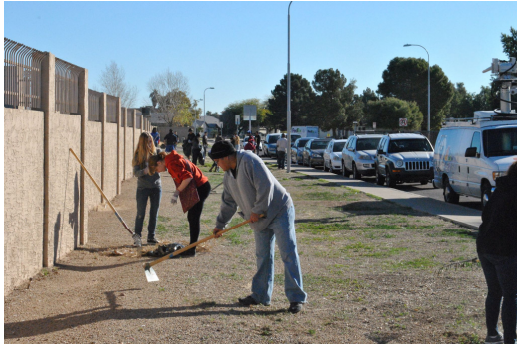
ASU students picking up trash in front of G. Frank Davidson School