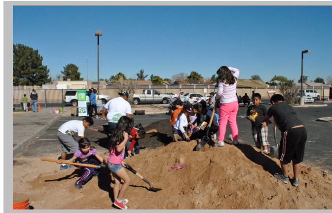
Students from G. Frank Davidson School are helping to shovel dirt to the new garden they are building!

"Everybody can be great...because anybody can serve. You don't have to have a college degree to serve. You don't have to make your subject and verb agree to serve. You only need a heart full of grace. A soul generated by love." — Martin Luther King, Jr.