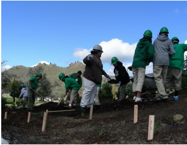
Cesar Chavez Day of Service