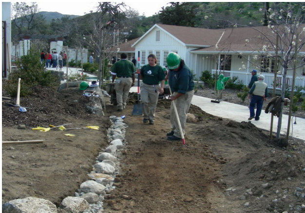
Cesar Chavez Day of Service