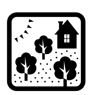
The end result benefits the entire neighborhood.