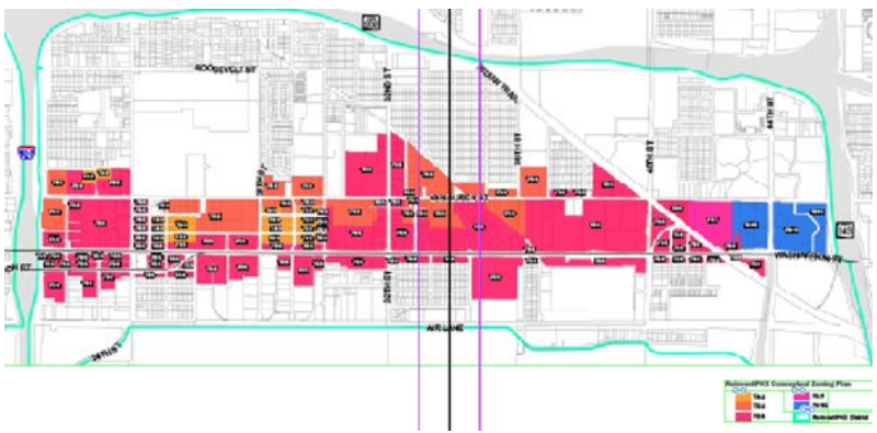
Policy basis for best practice form based code implementation.