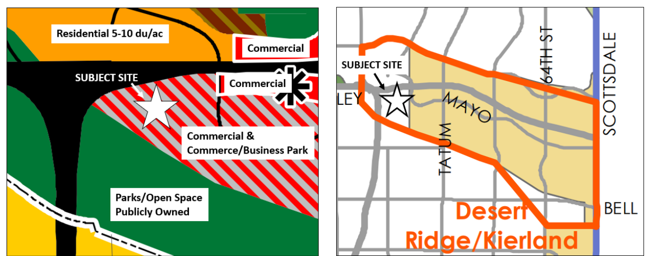
General Plan Land Use Map, Source: Planning and Development Department