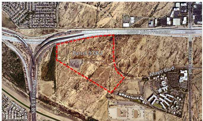
Aerial Location Map, Source: Planning and Development Department

Specific Plan currently allows development on Parcel 9.CP.2 pursuant to the Commerce Park zoning district with a modified use list and modified development standards, including a height limit of two stories and 40 feet and a maximum floor area ratio of 0.2.