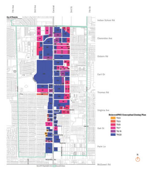
Policy basis for best practice form based code implementation.

In 2011, the U.S. Department of Housing and Urban Development (HUD) announced the availability of competitive grants to help cities and regions plan sustainable urban development. One of the factors HUD