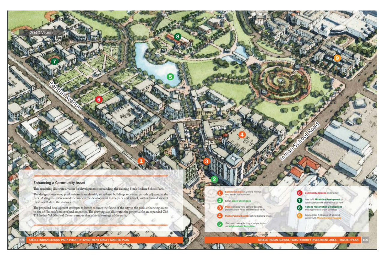
Figure 2: Conceptual Rendering of Master Plan Vision

The conceptual master plan for the site was developed based on the vision and standards outlined in the Phoenix Indian School Specific Plan. Figure 2 below highlights the master plan's