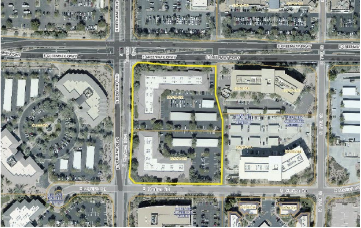
Aerial Map

Currently the site has a land use map designation of Industrial. This General Plan Amendment proposes a land use map designation that will allow for alternative housing choices in the area. Recent development suggests the Kierland area is evolving to include a mixture of housing choices along with the commercial and employment uses.