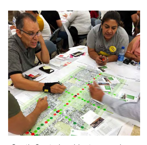
South Central residents engaging in community workshop activity.

The March 9th closeout session reflected information that was collected during the first workshop with continued feedback and discussion from community members imagining a future state of the community in 2045. The event began with a community conversation about planning elements focused on "what is needed?" and "where it is needed?" Community members participated in a table exercise. Each table had a map of a station stop area. Highlighted were nodes labeled as transit, arterial and neighborhood zones, based on their proximity to the proposed light rail stops. Participants were asked to mark locations on the map with potential land use types using pre-marked stickers of amenities that they would like to see within the community. The exercise allowed for participants