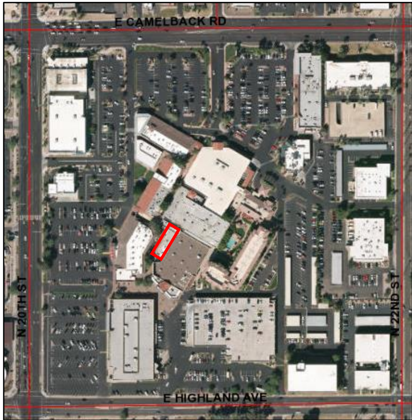
Aerial Map, Source: Planning and Development Department

To the east of the property is C-2 CEPCSP (Intermediate Commercial, Camelback East Primary Core Specific Plan) zoning, developed with offices and a restaurant.