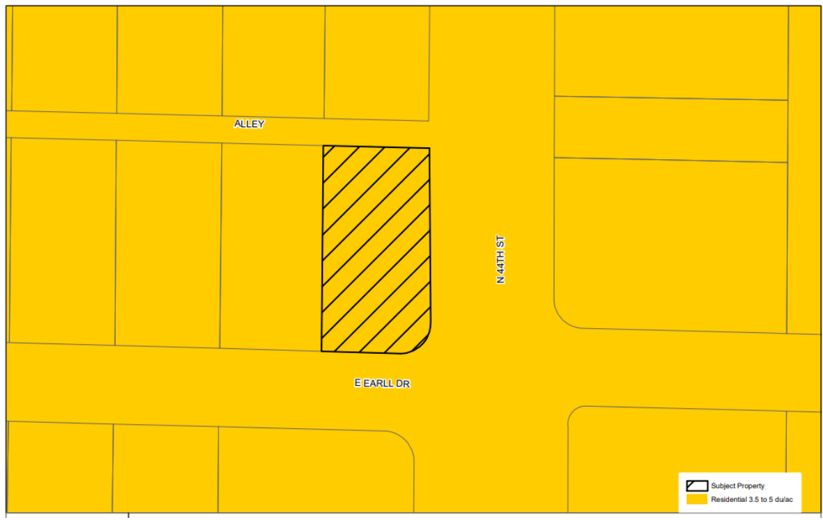
General Plan Land Use Map; Source: Planning and Development Department

3. The General Plan Land Use Map depicts the subject site with a designation of Residential 3.5 to 5 dwelling units per acre. The properties to the north, south, east and west have a General Plan Land Use Map designation of Residential 3.5 to 5 dwelling units per acre. Although the proposal is not consistent with this designation, an amendment is not required as the subject parcel is less than 10 acres.