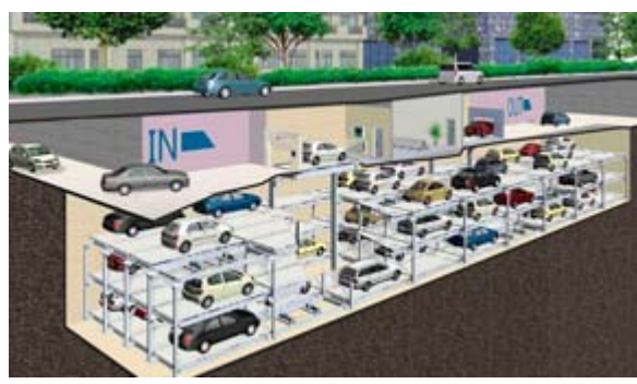
Example of an automated parking storage and retrieval system. Credit: Sumitomo Heavy Industries, Ltd.

14. Parking for this 8-story development is proposed to be an automated storage and retrieval system, the first of its kind in Arizona. This type of system allows the actual parking process to proceed automatically after the driver and passengers exit the vehicle. Drivers deliver their vehicles in the entry space and sensors then verify that the space is empty of occupants. The vehicle is then moved and parked. The reverse occurs for retrieval of vehicles.