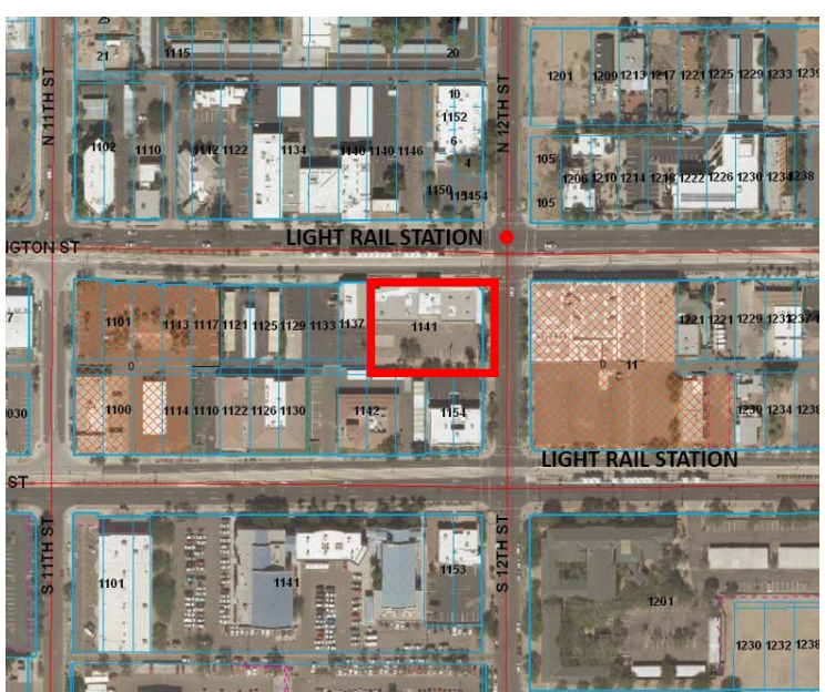
Aerial view of subject site and surrounding properties.

The property to the east of the subject site is zoned C-2 HR TOD-1 (Intermediate Commercial, High Rise, Interim Transit-Oriented Zoning Overlay District One) and is being developed with a 5-story mixed use residential building.