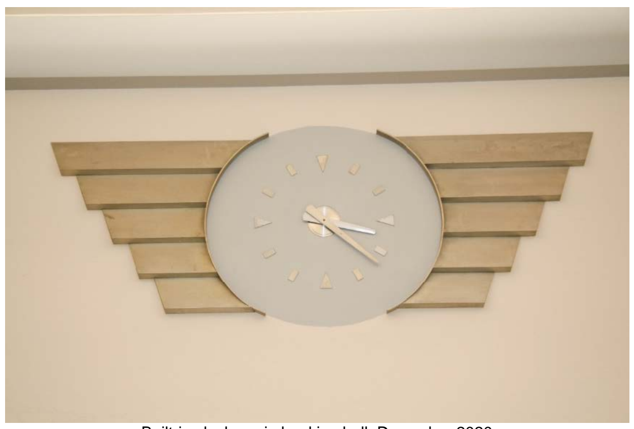
Built-in clock, main banking hall, December 2020