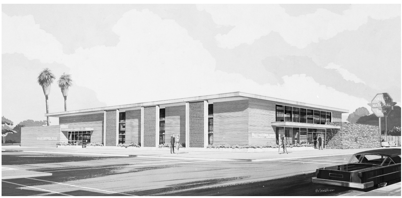
Architect's rendering, 1956