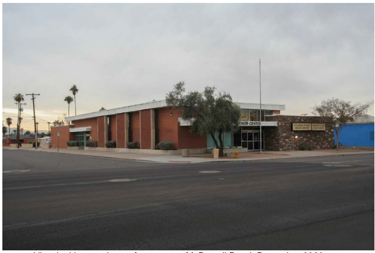
View looking southwest from across McDowell Road, December 2020