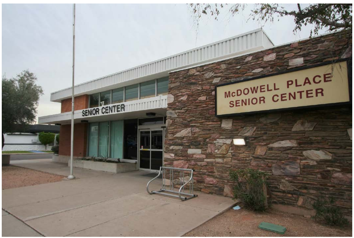
View looking southeast at north façade, December 2020