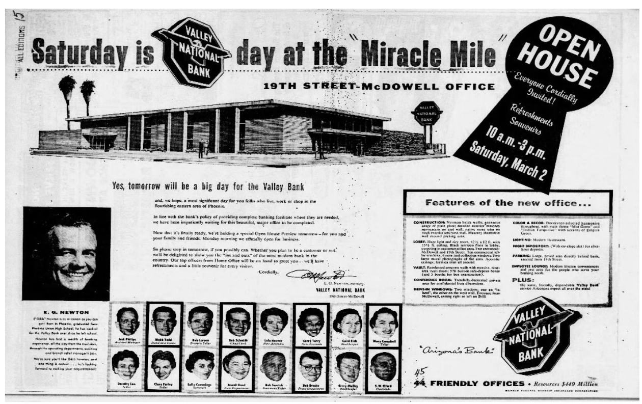
Advertisement from the Arizona Republic newspaper, March 1, 1956