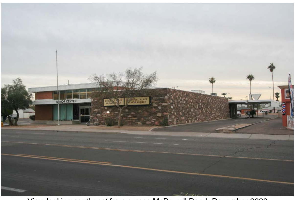
View looking southeast from across McDowell Road, December 2020