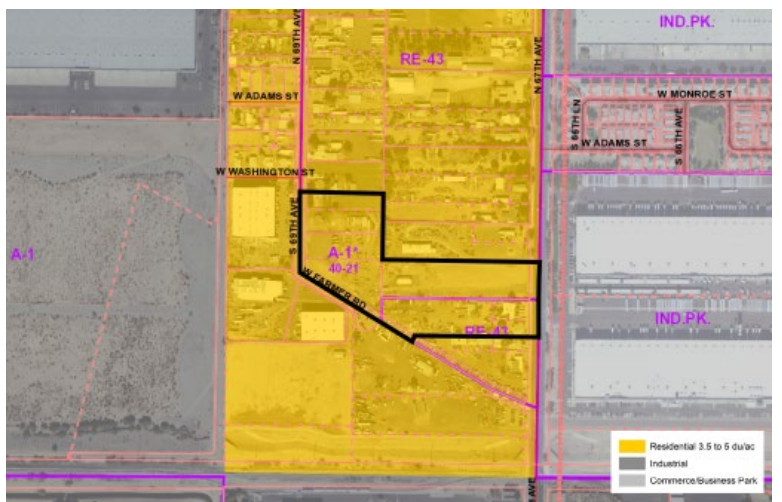
General Plan Land Use Map

3. The subject site, as well as the surrounding area to the north, south, and west are designated as Residential 3.5 to 5 dwelling units per acre on the General Plan Land Use Map. The property to the east, across 67th Avenue, is designated as Commerce/Business Park. Additionally, further west of the subject site is designated as Industrial. The proposed A-1 zoning is not consistent with the General Plan Land Use Map designation; however, the gross site acreage does not exceed 10 acres. As a result, a General Plan Amendment is not required.