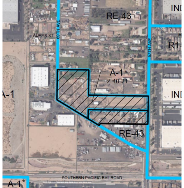
Existing Zoning Aerial Map

North of the subject site, along 69th Avenue, is a single-family residence zoned RE-43. North of the site, along 67th Avenue, is outdoor storage/industrial use also zoned RE-43. East of the site, across 67th Avenue, is a warehouse development zoned Ind. Pk. (Industrial Park). Furthermore, south of the subject site are numerous open storage and industrial uses zoned RE-43 and A-1. Warehouses and open storage are located west of the subject site, across 69th Avenue, zoned A-1.