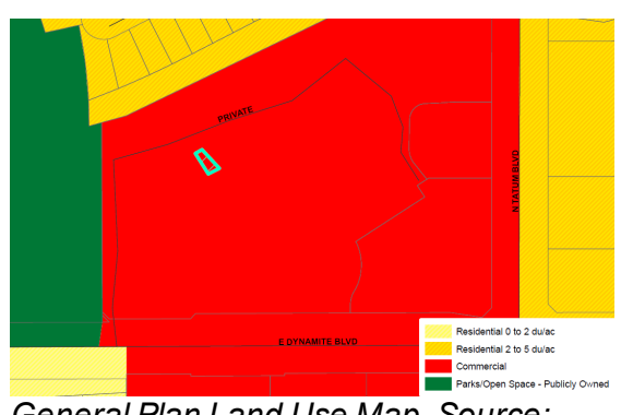
General Plan Land Use Map, Source: Planning and Development

The surrounding General Plan Land Use Map designations are Residential 2 to 5 dwelling units per acre to the north and east, Commercial to the south, and Parks/Open Space – Publicly Owned to the west.