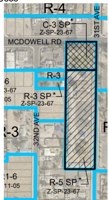
Figure B: Site Context and Surrounding Land Uses