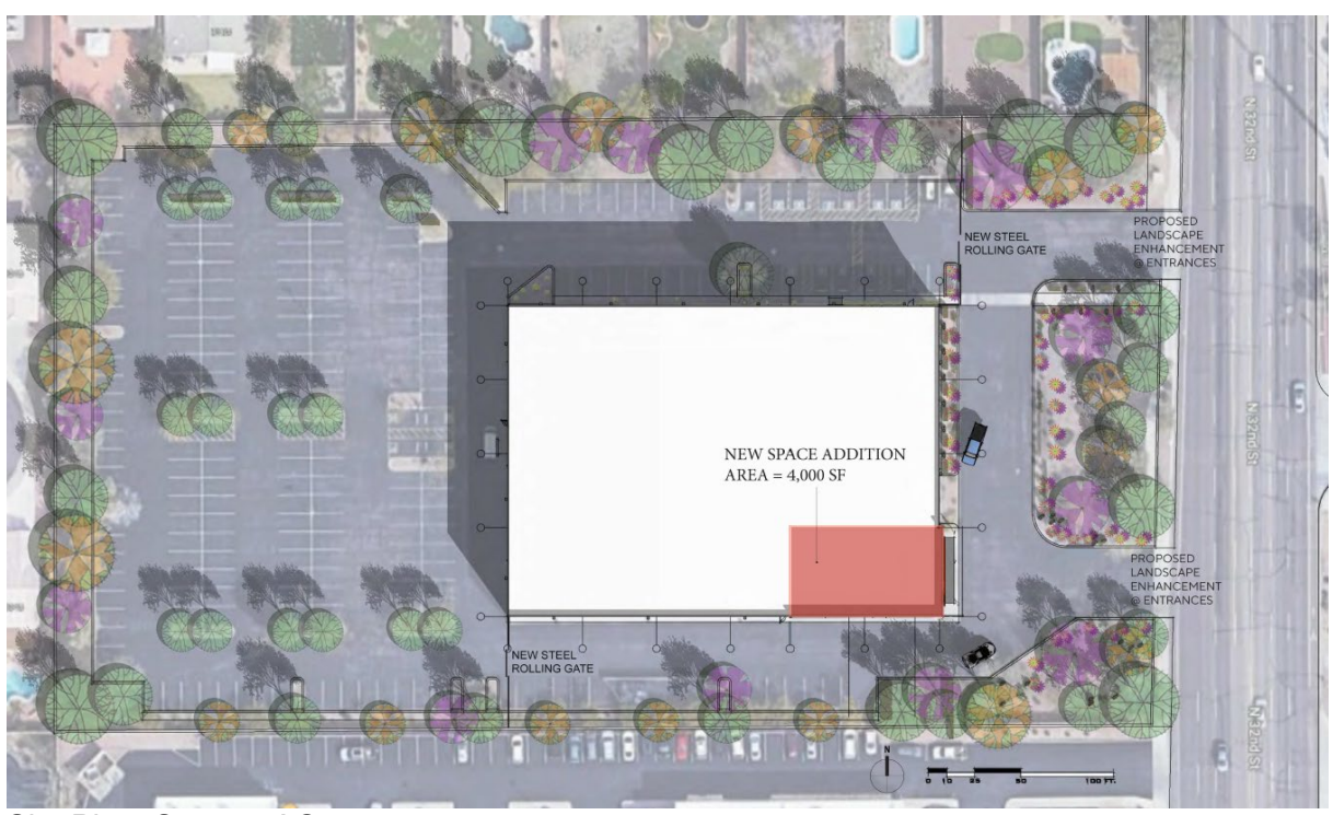
Site Plan

The development's sole access point is along 32nd Street, where two driveways are existing. The proposal is to utilize an existing commercial site where a one-story building and surface parking exists. This project proposes to maintain the site largely untouched, with the exception of enclosing an open loading dock along the southeast corner of the existing building, provide enhanced plantings along the front landscape setback, and building enhancements along the east building elevation oriented towards 32nd Street.