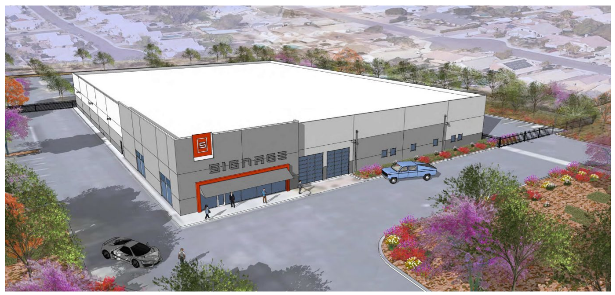
Conceptual Building Rendering

The proposed maximum height of 30 feet and maximum lot coverage of 50 percent are consistent with the standards in the C-2 zoning district. The proposed minimum building and landscape setbacks exceed the standards in the C-2 zoning district.