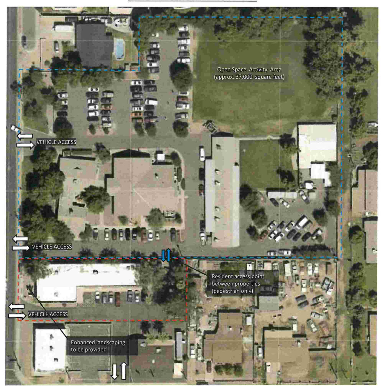
EXHIBIT D: CONCEPTUAL SITE PLAN