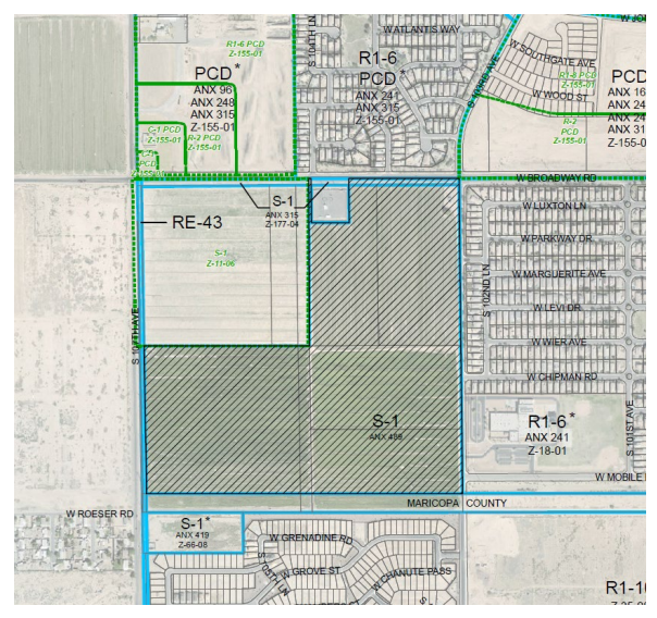
Surrounding land uses

South of the subject site is a proposed single-family residential subdivision zoned R1-10 (Single-Family Residence) and a vacant property zoned S-1 (Ranch or Farm Residence). Additionally, there is a