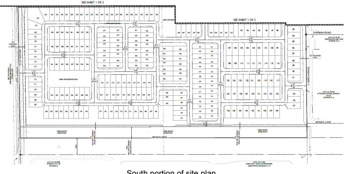
South portion of site plan.