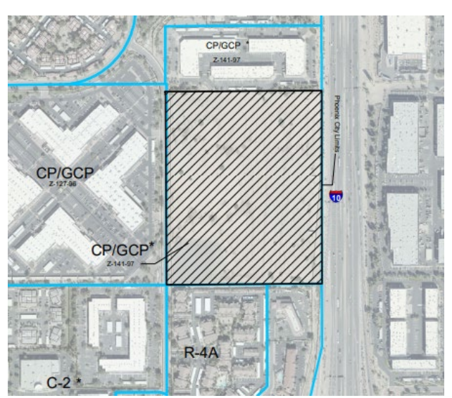
Existing Zoning Aerial Map

2. The proposed PUD will support new commerce park and industrial uses on the site adjacent to the I-10 Freeway. The property to the north consists of numerous offices including a data center and financing zoned CP/GCP (Commerce Park/General Commerce Park Option). To the south of the property, there is a multifamily development and hotel zoned R-4A (Multifamily Residence District) and CP/GCP (Commerce Park/General Commerce Park Option). To the east, across the I-10 freeway, in the City of Chandler, there are numerous uses including an engineering consulting firm, auto glass repair company, and other general offices zoned PAD (Planned Area Development). Finally, the property to the west, across 50th Street, is an office park zoned CP/GCP (Commerce Park/General Commerce Park