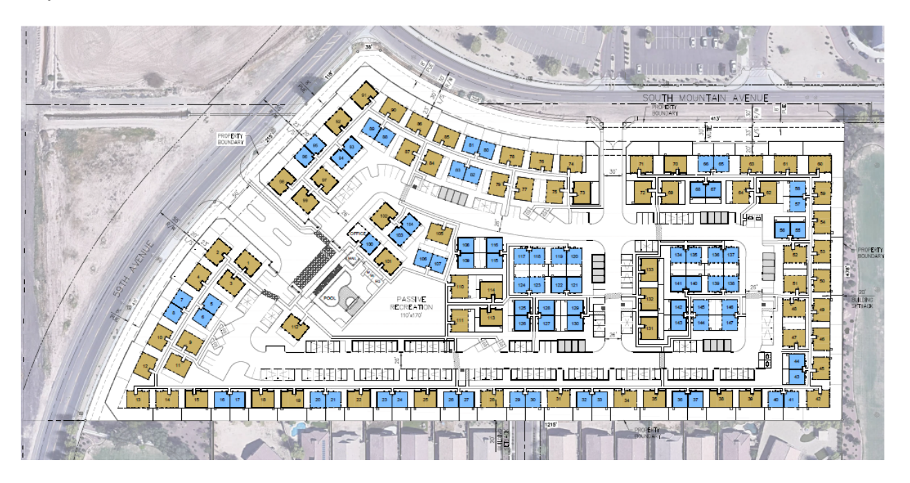
Proposed Site Plan

The conceptual site plan depicts open space areas in the center of the property but does not provide a square footage open space total. The Laveen Village has prioritized increased open space in all residential development. In response, staff has stipulated that at least 10% common area open space be provided. This item is addressed in Stipulation No. 1.