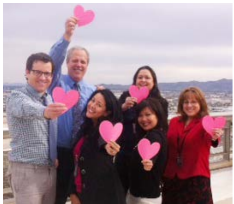
The city launched Instagram with an 'I Heart Phoenix' theme in February

To better serve you, always place your containers at least four feet apart and clear of obstructions, such as light poles, parked cars, and mail boxes. For more information about the holiday collection schedule, visit phoenix.gov/publicworks or call 602-262-7251.