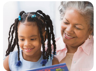
Adults can help a child learn to read.

Phoenix, in partnership with the AARP Foundation, is recruiting volunteers 50 years and older to support a tutoring program designed to improve elementary school students reading skills. Literacy tutors meet weekly with their assigned students within nine partnering Phoenix school districts. If you enjoy working and inspiring youth, then this opportunity is for you! For more details, email ecphx@phoenix.gov , call 602-256-4388 , or visit Phoenix.gov/Education/Experience .