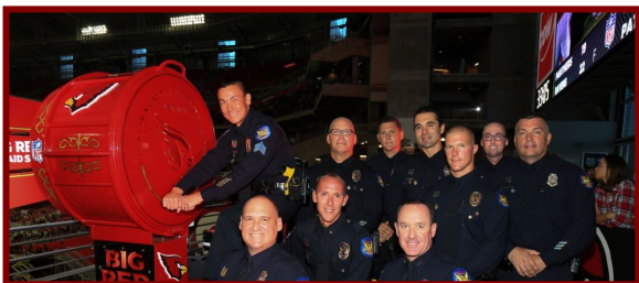
Members of the Phoenix Police Department 81X squad at last week's preseason Cardinals game.

The Phoenix Police Department says thanks to the Red Birds for their continuing support of our police family, and we wish our team great luck as they move toward a very successful season and Super Bowl 51!