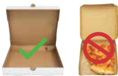
Recyclables must be free of food, grease and liquids