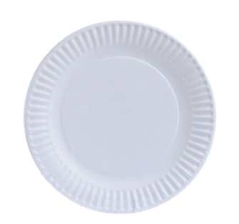
PAPER PLATES (NO WAX OR PLASTIC LINING)