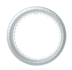
PAPER PLATES WITH WAX OR PLASTIC LINING