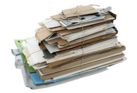
PAPER & CARDBOARD BOXES