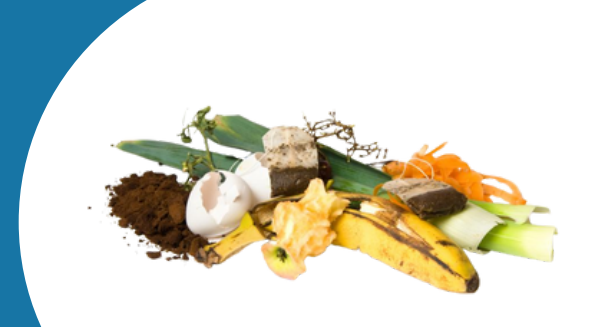
ALL FOOD INCLUDING MEAT & DAIRY