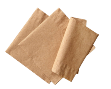
NAPKINS (BROWN PREFERRED)