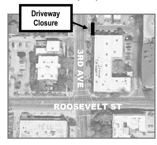
3rd & 5th Avenues Improvement Project ST87100164

If you have any questions, please call our 24-hour project hotline at: (480) 281-1506